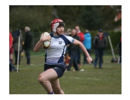
"Good photo. You can see they are passionate and enjoying the game. Shame it's not got any athletes in shot too." Online community

"Nice action shot to demonstrate her abilities." Online community